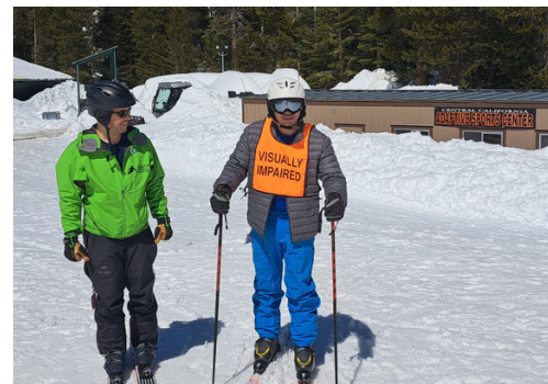
Client begins to ski with a guide to his right.

As you may know, this is our 50th year serving the Central Valley. We plan on continuing these important efforts to engage with our community and we hope you can support us in these new efforts, whether it's through volunteering, donating, or spreading the word about these opportunities. There are still many people in your community who need our services, but do not know VCB is available to help. It takes community members like YOU to ensure that VCB remains available and that others know about our services.