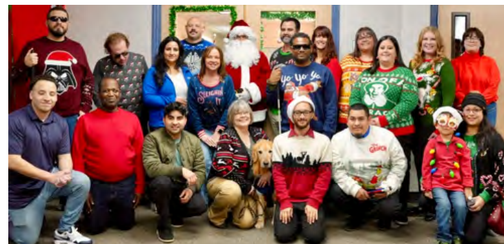
Staff at the Holiday Open House in Fresno posing for a group photo with their holiday sweaters.

This year, we invited staff, clients, and community members to break out their best ugly holiday sweaters and join us for a festive celebration filled with delicious treats. All three of our sites enjoyed a joyful day of seasonal fun, complete with photos with Santa and plenty of holiday cheer. A heartfelt thank-you to the wonderful businesses who generously provided sweets and beverages—your support made this celebration truly special.