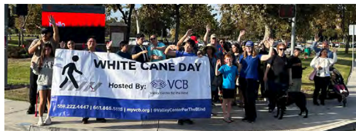
Clients and their families holding up a White Cane Day Banner at The Park at Riverwalk in Bakersfield.

VCB hosted picnics in Fresno and Bakersfield to celebrate White Cane Day and raise community awareness. White Cane Day is an annual celebration on October 15 that recognizes the independence, mobility, and civil rights of people who are blind or visually impaired, highlighting the white cane as a symbol of freedom and equal access. VCB staff and clients enjoyed food, games and a group walk that highlighted independence and mobility. Events like these provide meaningful opportunities to connect, celebrate, and spend time with others who share similar experiences. We hope you join us in 2026!